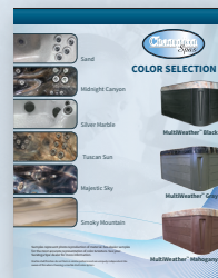
Champion Spa® Color/ Design Selection Card