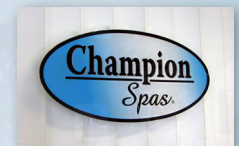
Champion Spas® Window Decal