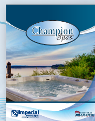
Champion Spas® Brochure