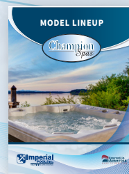
Champion Spa® Model Line-Up Flyer