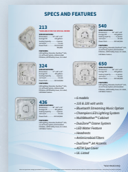
Champion Spa® Specs/ Features Flyer