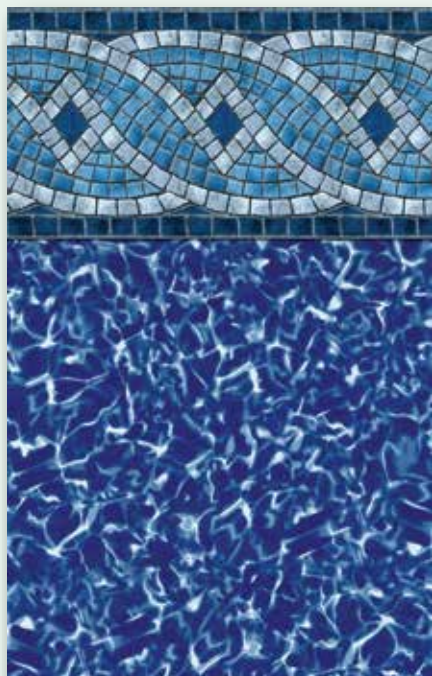
Princeton Tile with Sundance Floor