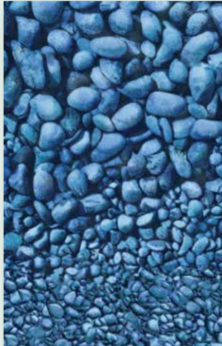
Castle Rock with Pebble Floor

20 Gauge | Overlap Fits 48" / 52" / 54" Wall