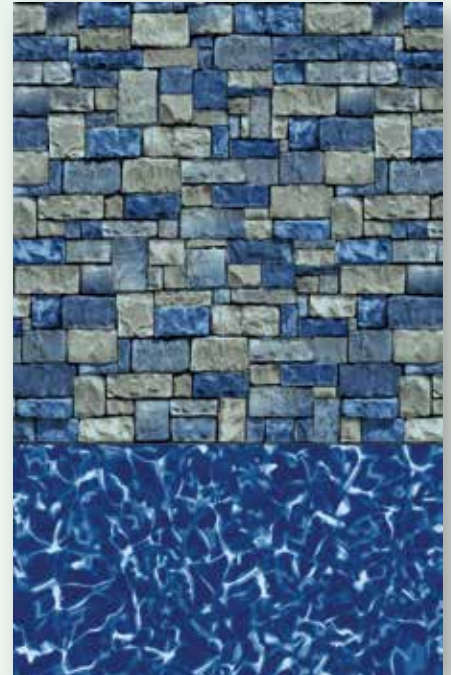
Fieldstone with Sundance Floor

20 Gauge | Overlap Fits 48" / 52" / 54" Wall