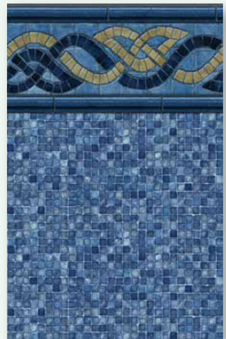
Fusion Tile with Radiance Floor