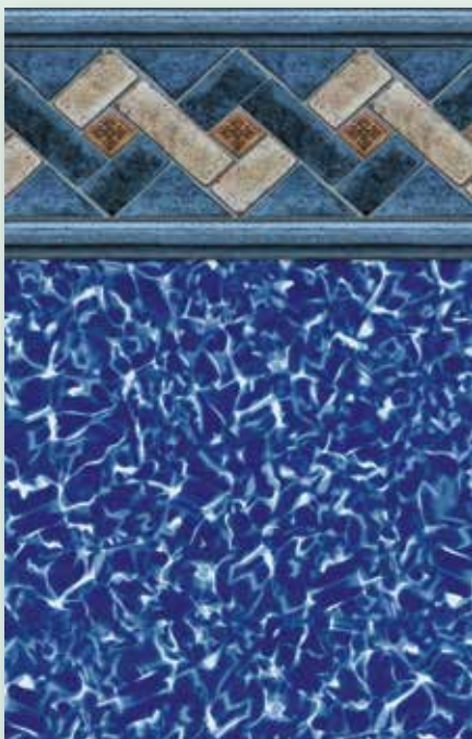
Ventura Tile with Sundance Floor

20 Gauge | Overlap Fits 48" / 52" / 54" Wall