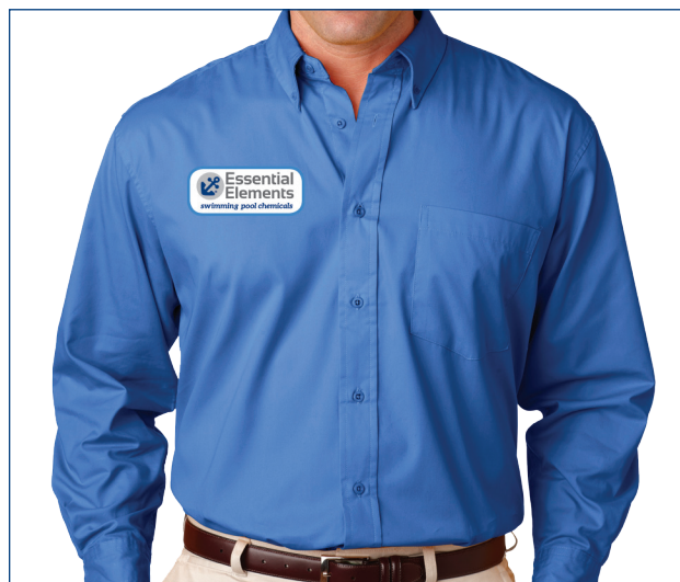
Embroidered Dress Shirts