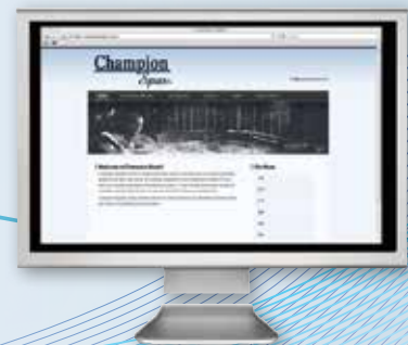
Champion Spas® Website www.championspas.com