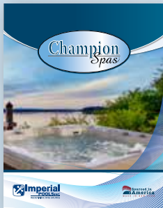
Champion Spas® Brochure