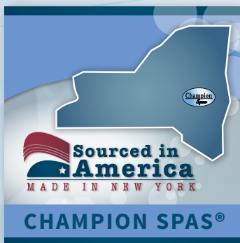
Champion Spas® 4' x 4' Made in NY Banner