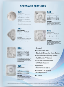
Champion Spa® Specs/ Features Flyer