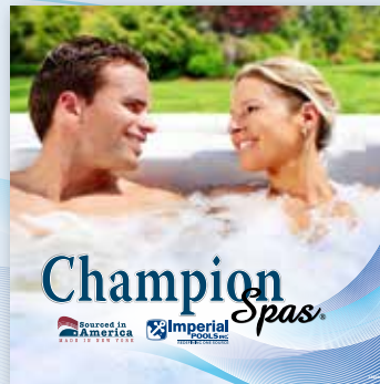
Champion Spas® 4' x 4' Lifestyle Banner

Includes: Champion Spas® Dealer Tools Champion Spas® Product Guide