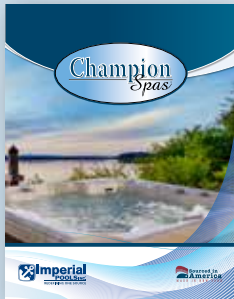
Champion Spas® Brochure