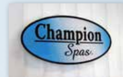
Champion Spas® Window Decal