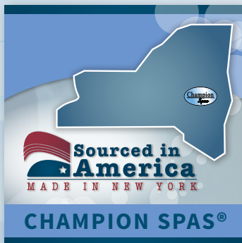
Champion Spas® 4' x 4' Made in NY Banner