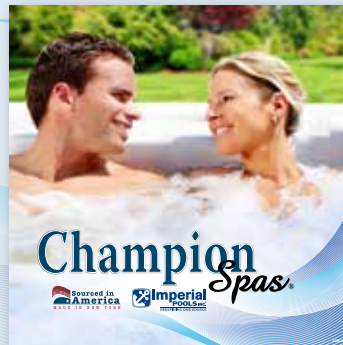
Champion Spas® 4' x 4' Lifestyle Banner