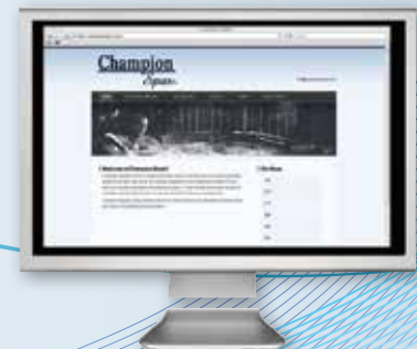
Champion Spas® Website www.championspas.com

Includes: Champion Spas® Dealer Tools Champion Spas® Product Guide