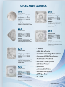
Champion Spas® Specs/ Features Flyer